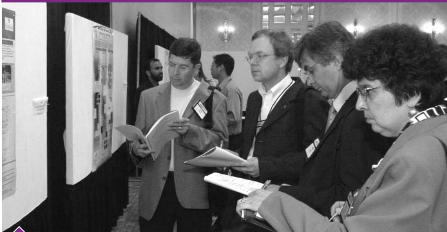
AUTO21 thanks the members of the Scientific Advisory Committee who met the challenge of judging 36 booths and four HQP posters.

AUTO21 is pleased to donate approximately 20,000 Starwood Preferred Guest points accumulated from conference expenses at Le Centre Sheraton to the Yves Landry Foundation. These points will assist the non-profit organization reduce its travel costs as it promotes skilled trade education to secondary students across Canada.